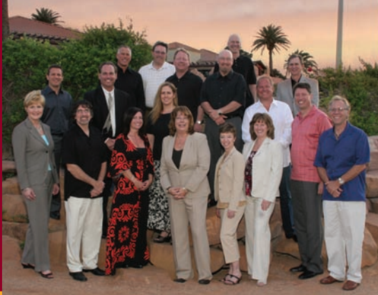
Faith Lutheran Business Advisory Council

Invites You to Breakfast With Shelley Berkley