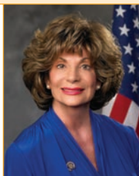
Congresswoman Shelley Berkley

As dynamic as the community she serves, Congresswoman Shelley Berkley has represented the families of Nevada's First Congressional District since 1999 and is currently in her sixth term as a Member of the U. S. House of Representatives. Working to meet the needs of the rapidly growing Las Vegas Valley is a key focus of Shelley's work in Congress. Her priorities include jump starting the economy; creating jobs; helping families stay in their homes; securing more resources for education and transportation in southern Nevada; increasing access to affordable, high-quality healthcare for America's families; developing clean, alternative energy sources; fighting the proposed Yucca Mountain nuclear waste dump; protecting Social Security; and strengthening American alliances abroad to work toward international stability and peace.